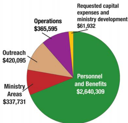
2010 Operating Expenses ($3,763,730) and Capital Expenses ($61,932)