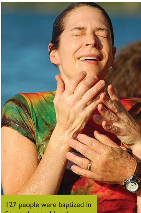
127 people were baptized in September and June!