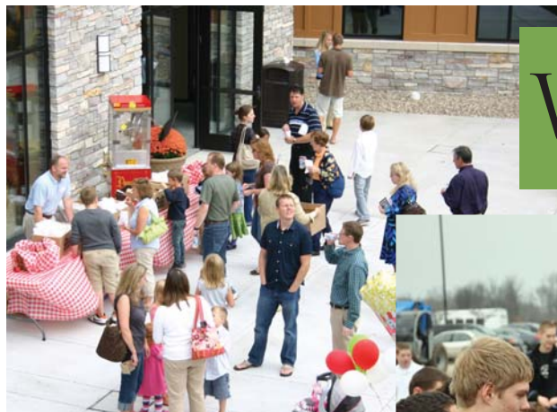
(Right) students write verses & blessings on the steel beams for the Phase 2 building. (Above) People enjoy the new space at the Phase 2 Open House.