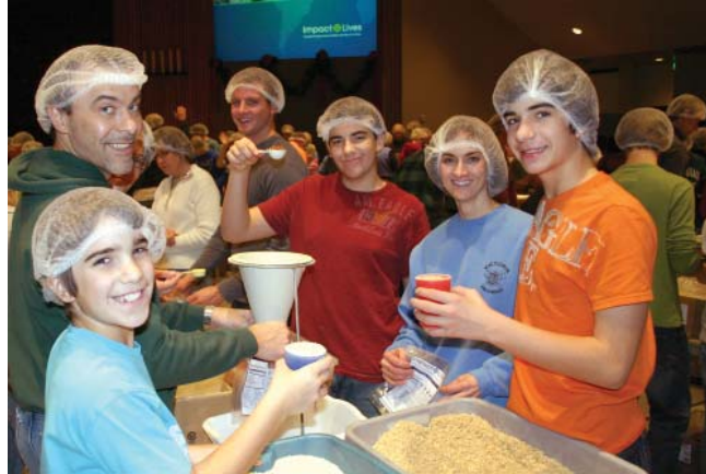
More than 1,000 people packed food for Haiti in December

on a "High Seas Adventure," discovering God's Amazing Love at Vacation Bible School. The voyage through God's Word was