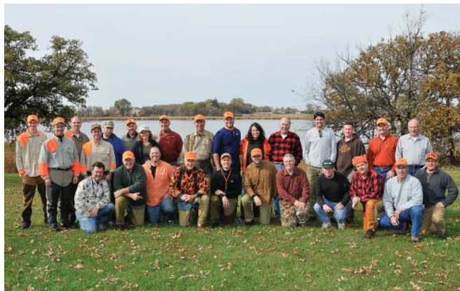
Success Through Scripture Pheasant Hunt, October 2009

whole MOPS group. Women are mentored in spiritual leadership as they, many for the first time, use their gifts in leading MOPS.