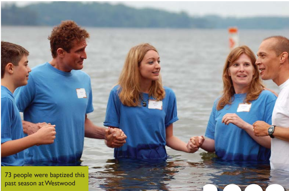
73 people were baptized this past season at Westwood