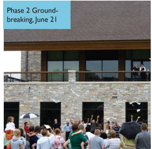
Phase 2 Ground-breaking, June 21