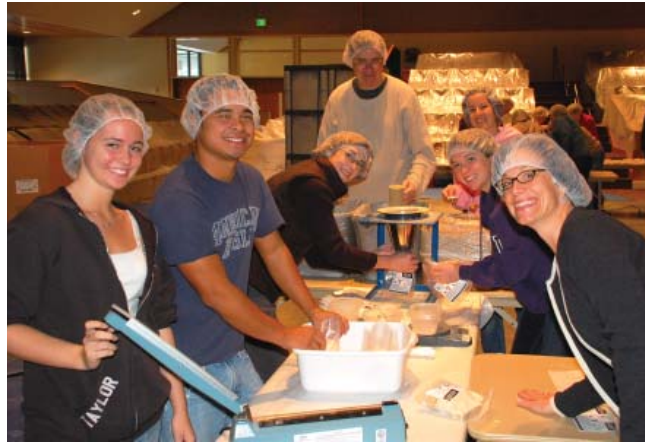
First-ever Feed My Starving Children food packing event at Westwood in November, 2008. 700 people packed 150,000 meals!

Women’s Special Events offered three different connection events this year as well as the new “Tour of Tables” which brought over 100 women! At each event, women commented on how good it felt to be together and develop relationships. The Women’s Holiday Dessert continues to be the largest event with many men and women serving and over 950 women attending this two-night event! The goal of giving women an opportunity to accept Jesus was met with